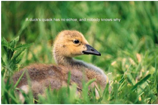
Did you know... a duck's quack has no echo, and nobody knows why.